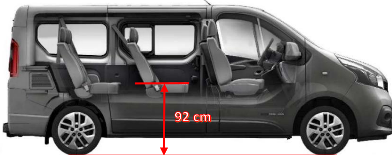
Example Renault Trafic