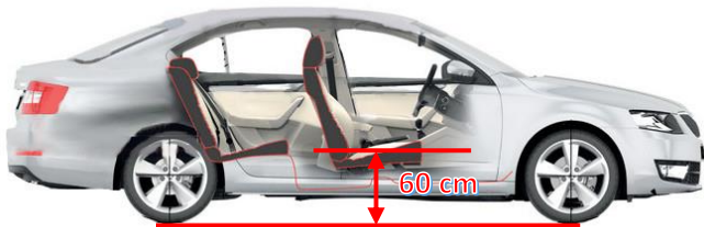
Example Škoda Octavia