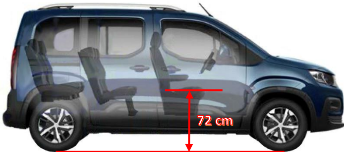
Example Peugeot Rifter